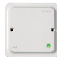
AH30 Communications Hub