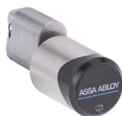
C103 Cylinder V3

A wide range of Aperio products can be deployed easily with the Gallagher solution, a selection of currently supported products is displayed below. For more detail on Aperio products, please contact your nearest Gallagher representative.