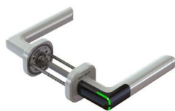
H103 V3 Handle RH V3