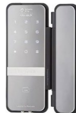
G103 V3 Glass Door V3