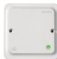
AH30 Communications Hub