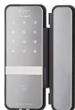
G103 V3 Glass Door V3