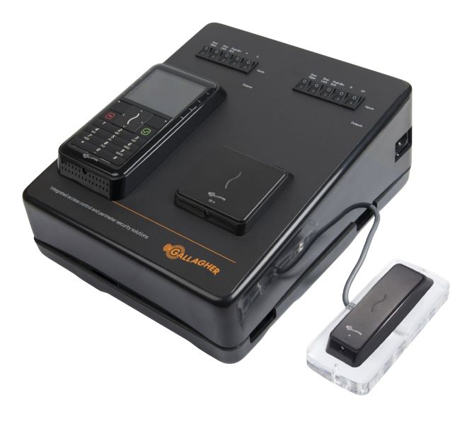
*MIFARE® is a registered Trademark of NXP B. V.