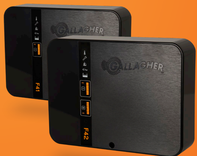
F42 Fence Controller G21950 - Dual Circuit