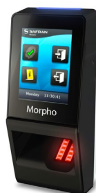
SIGMA Lite + Multi