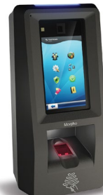
SIGMA Extreme Multi