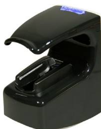
VP Dual Finger Vein