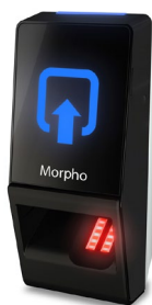
SIGMA Lite Multi

A wide range of IDEMIA products can integrate easily with the Gallagher solution, a selection of currently supported products are displayed below. For more detail, please contact your nearest Gallagher representative.