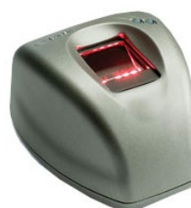
MSO 300 Enrollment Reader