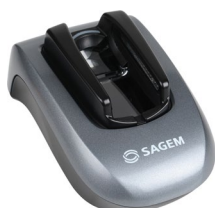
MSO FVP Finger Vein Enrollment Reader