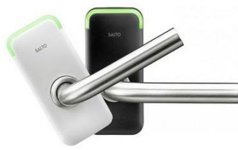
XS4 Mini EURO