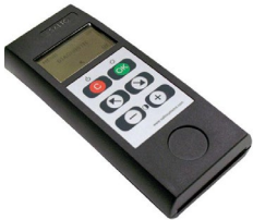
Portable Programming Device