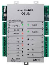
CU42 Control Unit