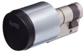
Geo Euro Half Cylinder