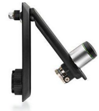
Server Cabinet Cylinder