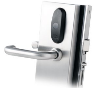
Glass Door Escutcheon