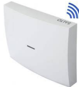
BLE Wireless Gateway