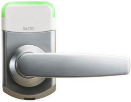
XS4 Mini ANSI

A wide range of SALTO products can be deployed easily with the Gallagher solution, a selection of supported products are displayed below. For more detail on SALTO products, please contact your nearest Gallagher representative.