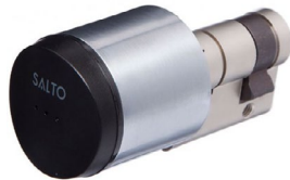
Geo Euro Half Cylinder