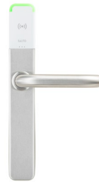
XS4 One Escutcheon