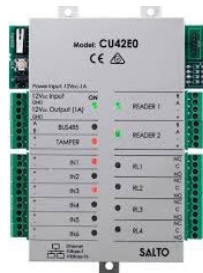
CU42 Control Unit