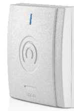
BLUEnet node 3