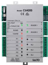
CU42 Control Unit