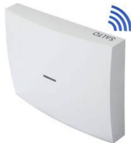
BLE Wireless Gateway