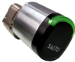
Neo Half Cylinder