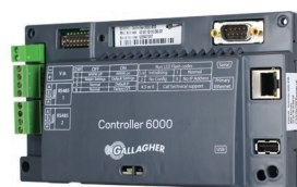
Controller 6000 Starter Kit Variant