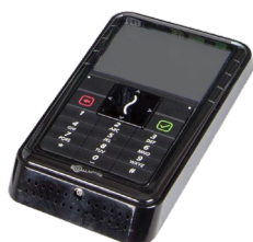
T20 Alarms Terminal