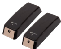
2x T15 Reader MIFARE® Black