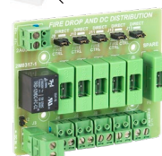
Fuse and Fire Relay Board