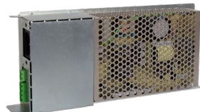
3.5A Power Supply