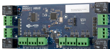
HBUS 8in 4out Board