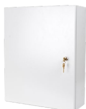
Starter Kit Cabinet

The Starter Kit is a complete package to get a small site up and running with integrated access and alarms management. Two kit variants are available: Standard or with an additional PSTN Dialer.